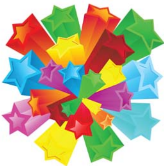
CHART has reached a new milestone. Five years ago, in August of 2006, we held our first board meeting.

The first year and a half were spent developing administrative items, such as a name, logo, mission statement, bylaws etc.